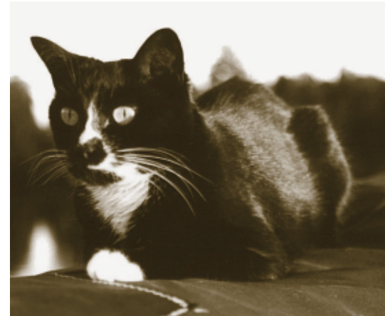
Magic on the boom