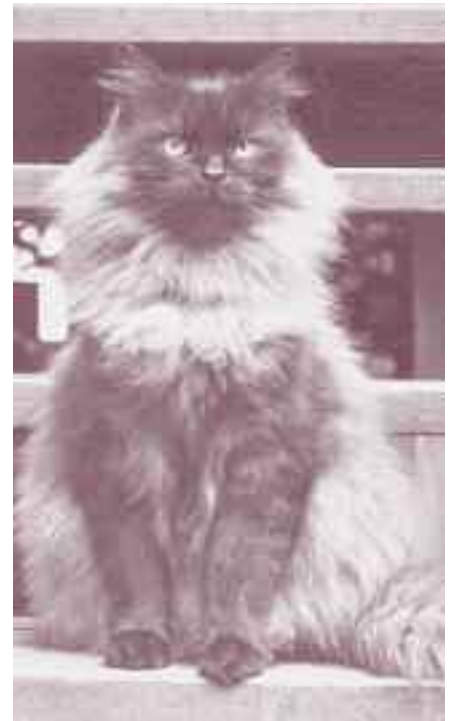
André in his senior years

So, why does this matter? Just as with people, different conditions become more likely to occur at different ages. In cats, we start screening for a decline in kidney function (renal insufficiency), an overactive thyroid (hyperthyroidism) and diabetes after their eighth year. We also check for more subtle changes carefully, such as high blood pressure, by measuring your cat's blood pressure. Small changes in weight are of greater significance, too. In fact, once a cat reaches 12, it is fairly common for them to start losing weight. This comes about, at least in part, because they aren't digesting their food as well but it can, and often is, because the early stages of renal insufficiency are gradually and insidiously starting. Don't be alarmed! Cats can often live for many years with this condition, but that requires that we recognize that it is present and help kitty appropriately. When kitties reach their golden geriatric years, we want to see them twice a year to screen them for, and monitor, these conditions. Your Mature Cat Program includes all of these tests (a comprehensive physical exam, blood and urine tests, blood pressure) was designed specifically for our special, older cats to help us help you keep them healthy and happy for as long as possible. 🐾